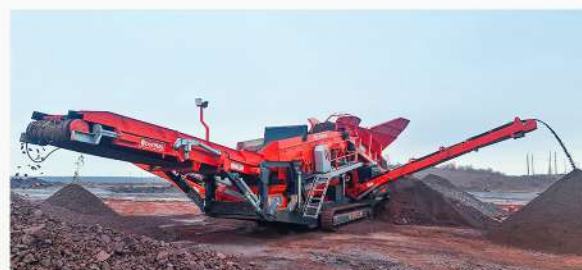
PROVIDES 3 DIFFERENT END-PRODUCTS WITH PRECISE DIMENSIONS BY 2-DECK SCREEN