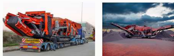
EASY TO TRANSPORT DUE TO FOLDABILITY

CAN EASILY BE COMBINED WITH OTHER BORATAS MOBILE MACHINES AS TANDEM WORKING.